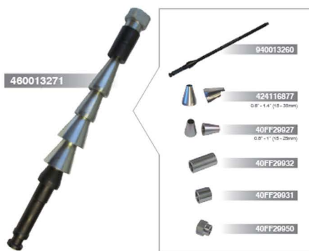
Motorcycle Shaft Kit 460013271