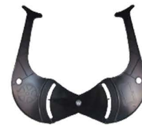
Rim Width Gauge 46FC77653