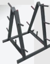
Accessory Rack 41FF03151