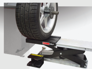
Pneumatic Wheel Lift 46FL85170