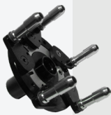
Pin Plate Adaptor Manual- 41FFA6478 Pneumatic- 41FFA5298