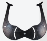
Rim Width Gauge 46FC77653