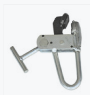
Plier for alloy rims