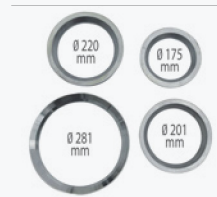
Ring protectors for alloy rims